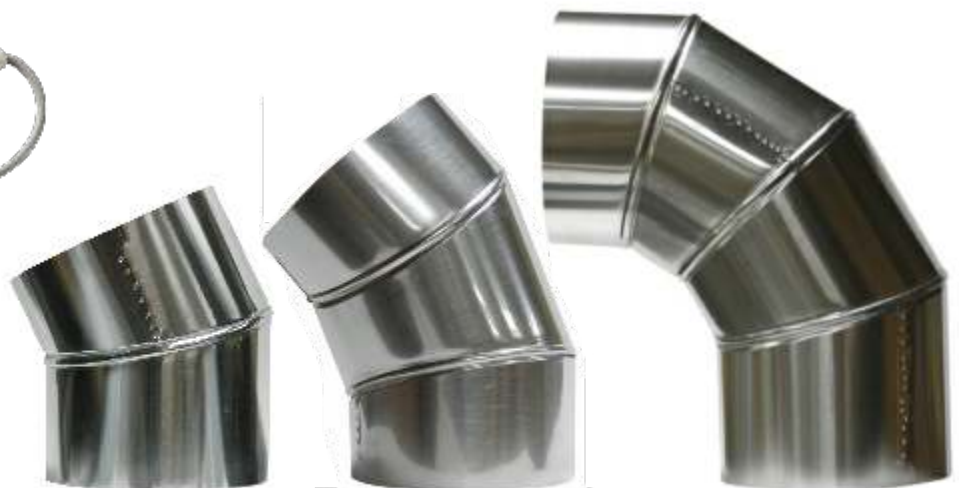
0-30 degree 290mm or 590mm long

For situations that require a more convoluted configuration these Vegalux™ adjustable angles allow for almost any installation to be possible whilst the 99.7% reflectivity ensures that minimal light is lost.